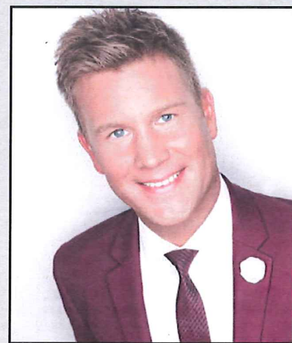
GMA DOVE Award nominated singer/songwriter